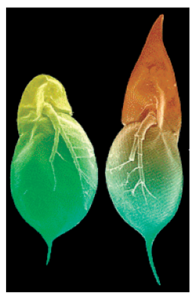
To the surprise of scientists, many environmentally induced changes turn out to be heritable. When exposed to predators, Daphnia water fleas grow defensive spines (right). The effect can last for several generations.

ture an impressive variety of proteins, cell types, and individuals.